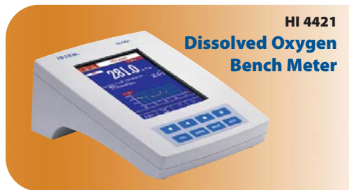
HI 4421 Dissolved Oxygen Bench Meter