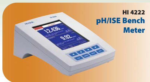
HI 4222 pH/ISE Bench Meter