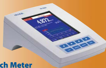
HI 4221 pH Bench Meter