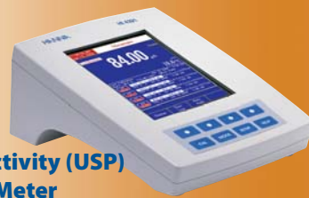
HI 4321 Conductivity (USP) Bench Meter