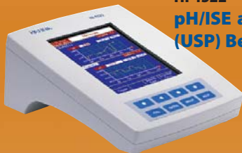
HI 4522 pH/ISE and Conductivity (USP) Bench Meter