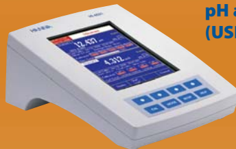
HI 4521 pH and Conductivity (USP) Bench Meter