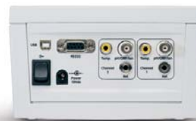
HI 4222 rear